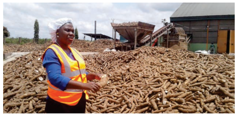
Cassava being processed

n line with the economic diversification drive of the Federal Government, the Central Bank of Nigeria (CBN), has declared its intention to intervene in cassava production to stop the importation of cassava derivatives valued at about $600 million annually.