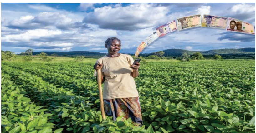
Ease of payment system

he Central Bank of Nigeria (CBN) has issued new regulations for the operation of indirect participants in the Payments System which is to take effect from 11th November, 2019.