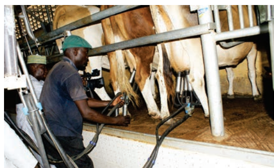
Cows being milked

he Central Bank of Nigeria (CBN) has announced the impending investment in milk production in Nigeria. This is due to the high cost of importation of dairy products amounting to $1.5billion spent on milk and dairy products. The investment will be done to enhance the resolve of backward integration to conserve foreign exchange and create jobs for the people.