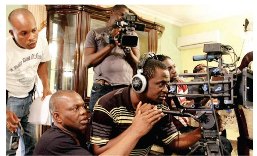
Some members of the creative industry in action

he Central Bank of Nigeria (CBN) in conjunction with the Bankers' Committee is set to support the growth of the creative industry comprised mainly of fashion, information technology, film and music through the Creative Industries and Financing Initiative (CI-FI) with an initial N22 billion funding.