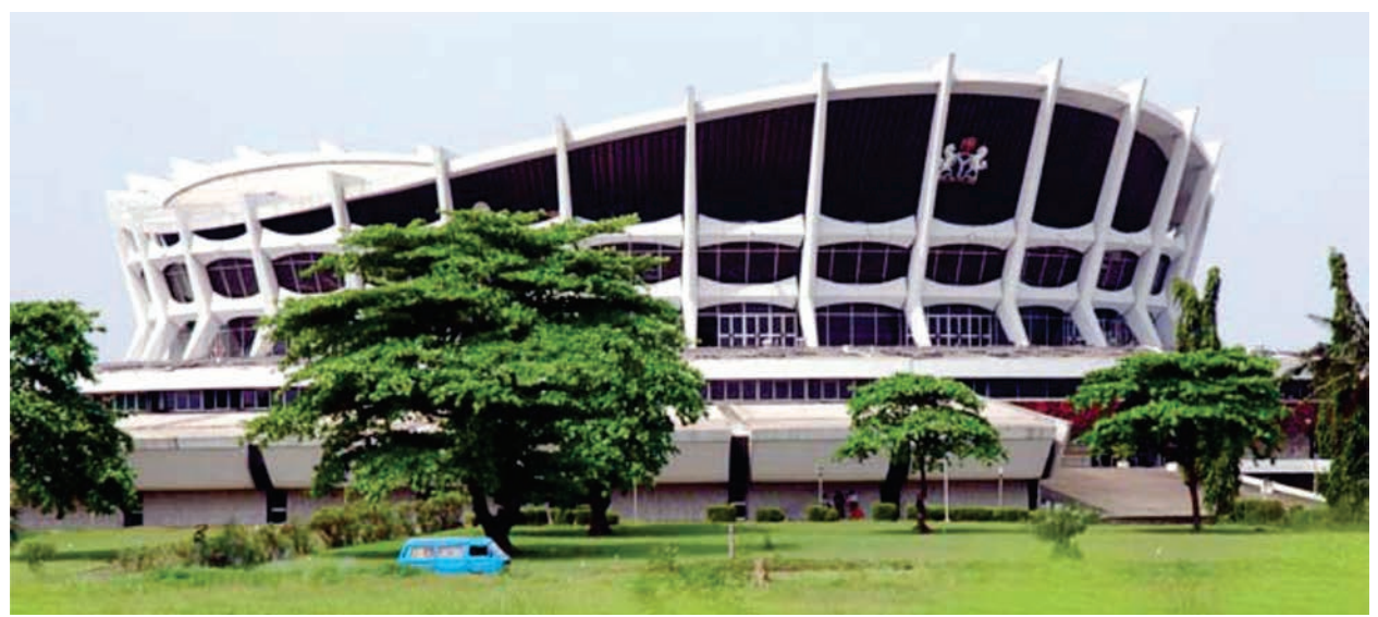
National Arts Theater, Iganmu Lagos

n a bid to tackle the menace of unemployment and boost job creation particularly among youths, the Central Bank of Nigeria (CBN) in collaboration with Bankers' Committee has introduced a Creative Industry Financing Initiative (CI-FI) to improve access to long-term, Iow-cost financing for entrepreneurs and investors in Nigeria.