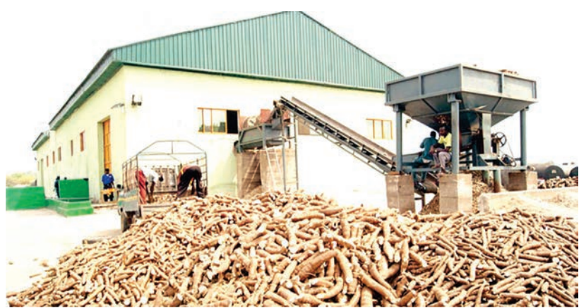
A cassava processing plant

n furtherance of its assured five million new jobs in the next five years, the CBN as part of its strategy, is set to boost cassava production from 50 million tonnes to 830, 820 metric tonnes by supporting the 51,388 cassava farmers in the country.