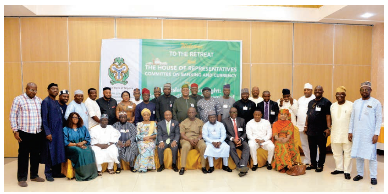
CBN Governor, Mr. Godwin Emefiele and some executives of the Bank with members of the House of Representatives Committee on Banking and Currency.

and creating jobs at the height of recession, stressing that there were structural inefficiencies in the economy that the Bank had to correct.