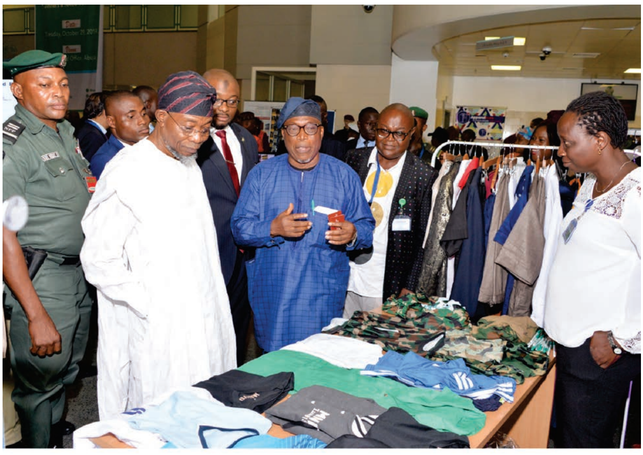
Government officials with some members of the uniformed services inspecting locally made textile at the CBN Head Office

According to him, the ceremony, which also attracted four State Governors (Kaduna, Cross River, Gombe and Katsina), two ministers and Service Chiefs as well as Heads of Uniformed Services and labour leaders, was the result of almost two years of painstaking activities and consultations with key stakeholders in the CTG value chain.